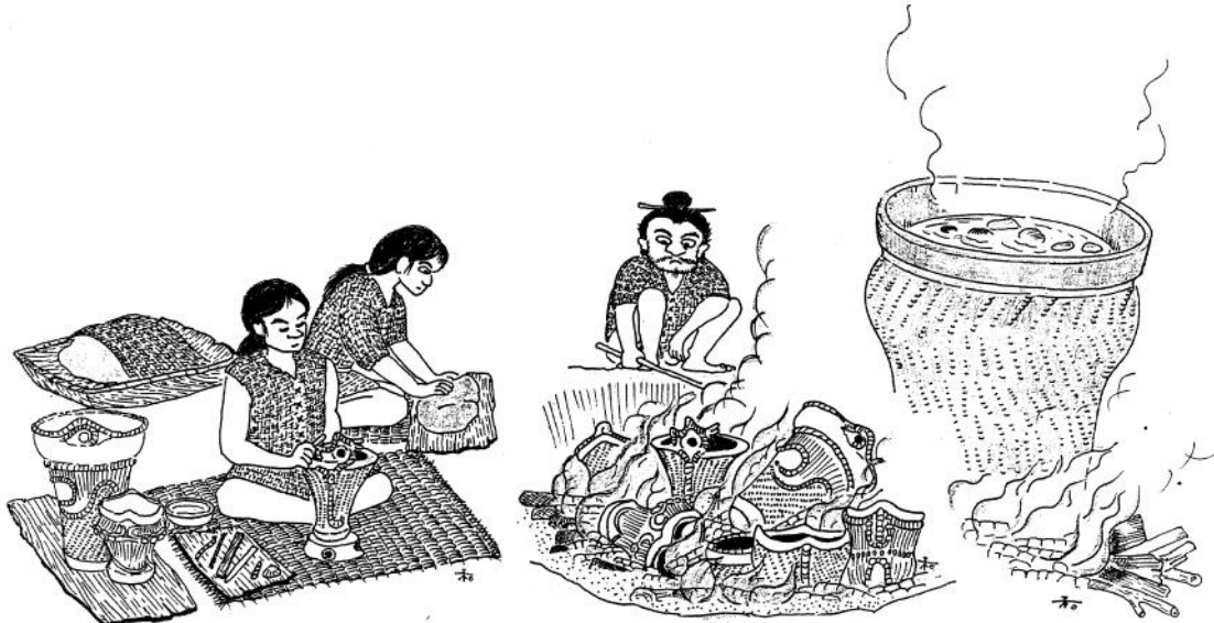
Making pottery and cooking by it

The Jomon people also had invented the new way of hunting, i.e. bow and arrow. Those new ways of life made their life easier than before.