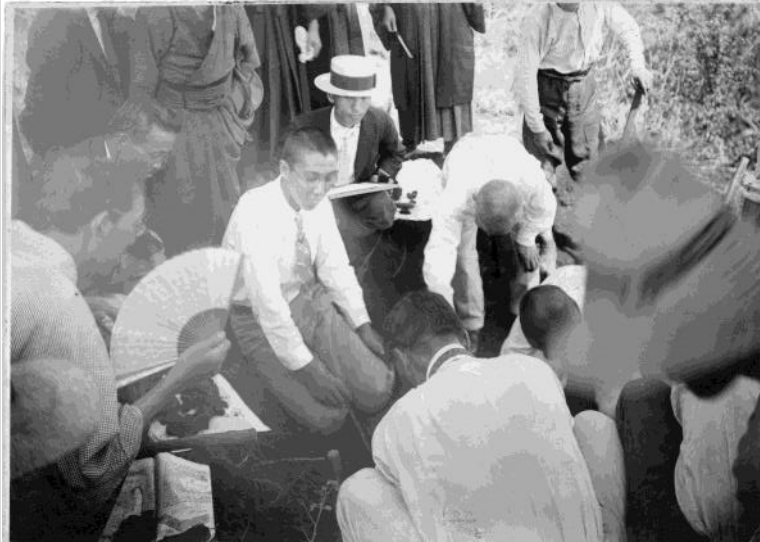
His Imperial Highness Prince Fushimi excavated the Togariishi site in 1929.